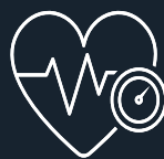
Blood pressure monitor