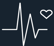
Sleep quality sensor